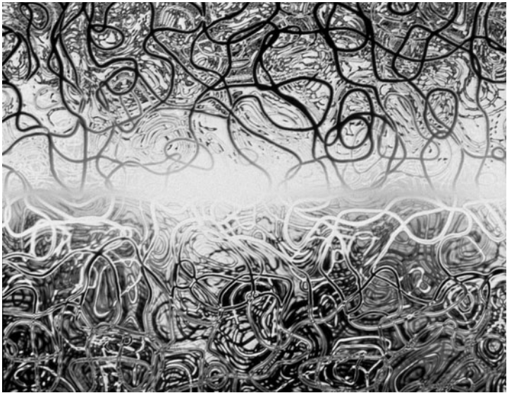
2. Evolved artwork. © Karl Sims, used by kind permission.